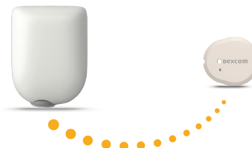
Pod and Dexcom G7 shown without necessary adhesive.

Customers with insurance plans requiring local pickup will be unable to be processed by ASPN (including Medicaid insured customers). They will need to start on Omnipod 5 with Dexcom G6 through their preferred pharmacy and wait for the new Pods to be available.